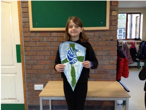
Y4 have designed and made Anglo Saxon Shields